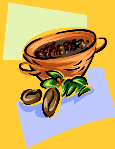
Blessed are they that hunger and thirst after righteousness: for they shall be filled. Matt 5:6

as far as the spiritual Kingdom of God is concerned, (because the wages of sin is death – spiritual death, spiritual separation from God [Romans 6:23]). That is why we all have a natural birth , and then a spiritual birth . Your spiritual birth is your choice. Some people come to this earth and miss it altogether – they never take the steps to receive the gift of salvation wrought by the blood of Jesus Christ for them; they never take the time to find out why God has created and put them on this earth for the period He has done so; and they never move forward to fulfill their assignment